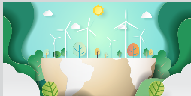
Excerpts from ARESKA's White Paper on Conformity Assessment in Wind Energy