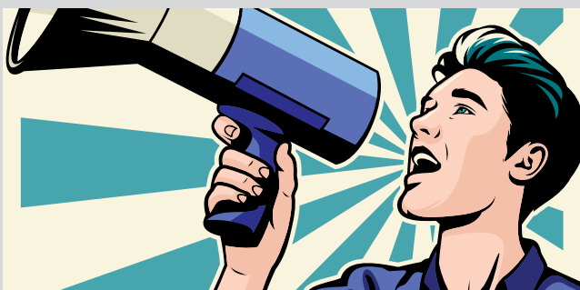
Call to Action and Participation in Standards!